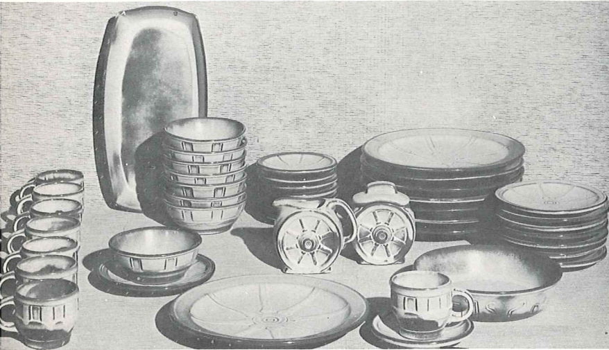
94LS—45 PC. SERVICE SET, BOXED—$46.00

AVAILABLE ONLY IN: Desert Gold and Prairie Green.